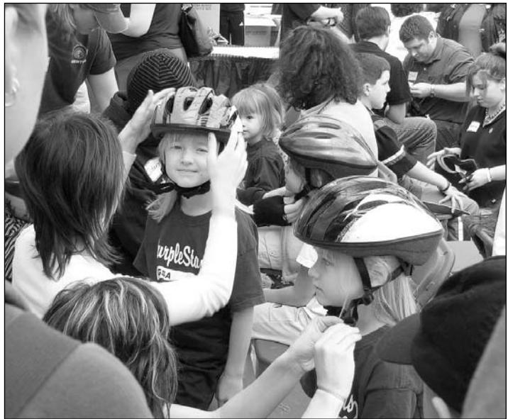
Volunteers fitted bicycle helmets for hundreds of children at the recent Legacy Salmon Creek Kids' Health and Safety Fair.

And, of the nearly 50 child/infant car seats checked for free, 31 were found to be used incorrectly. The